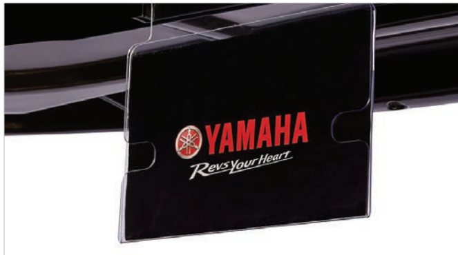
FusionFit™ Info Card Holder

Promote your course activities on this FusionFit™ Information Card Holder with incomparable strength that easily stands up to everyday use in any temperature. Fits 2010 and newer DRIVE and Drive² cars with factory ClimaGuard Sun Top. JOB-F16L0-V0-02 NOTE: Fits with ClimaGuard™ Sun Top.