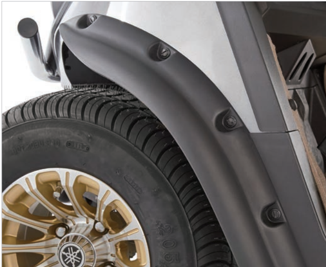
Drive² Fender Flare Kit

Sporty styling adds an aggressive, tough look and feel while adding an extra level of protection from mud and water. Fender flares are made from a durable, injection-molded polypropylene, UV-resistant material. Fits all Drive² models including 2017-2023 Drive² Concierge 4/6 models.