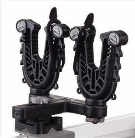
ATV TEK FLEXGRIP™ PRO

NOTE: Requires a UMAX FusionFit Bed Attachment Kit.