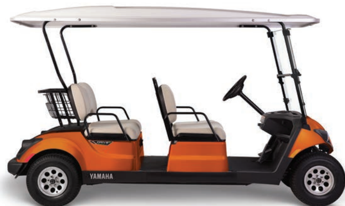
ATOMIC FLAME Matte