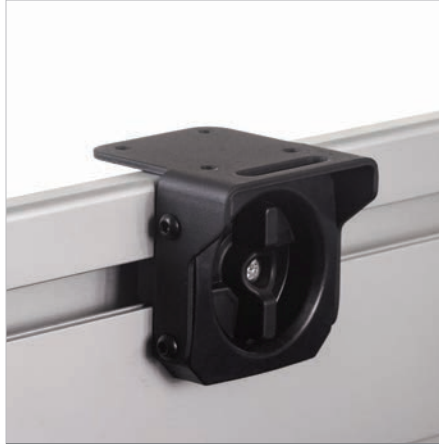
UMAX FusionFit™ Bed Attachment Kit

Our FusionFit™ Bed Attachment Kit will help keep your rakes, shovels, guns, bows and other long-handled tools always at-the-ready. Yamaha's FusionFit accessory system provides a tool-less design that allows you to "click and go" with only a quarter turn. An integrated padlock slot gives you the option to easily secure your cargo and go. Fits 2019-2020 UMAX One/Two, UMAX One/Two Rally, UMAX Range Picker, and UMAX One/Two with Hard Cab models. Sold in pairs.