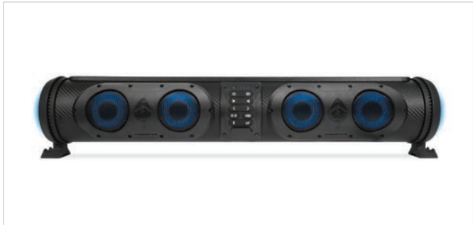
EcoXGear® SoundExtreme Sound Bar

NOTE: Easily add aftermarket amplifiers or powered subwoofers through the 4v RCA low-level pre-output.