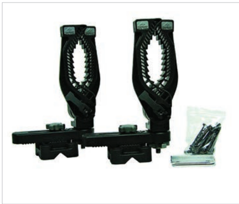
ATV TEK Elite Cam Lock Grip

The ATV TEK V-GRIP offers the most versatility in one multi-use V-Grip. A truly custom fit for your handled tools, soft gun case, bow, ice auger or any other item. Highly adjustable to ensure a perfect, secure fit. Largest size range accommodates more items with infinite locking positions. Quickly and easily access your gear with the tool-free, ratcheting design. Flip cam lock ensures your gear won't fall out while you're hard at work.