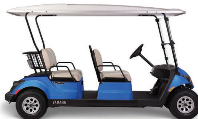
AQUA BLUE Metallic