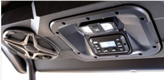
Overhead AM/FM Bluetooth® Audio System

Instead of playing music through your cellphone speakers, enjoy your favorite tunes through our Overhead AM/FM Stereo with Bluetooth® that can withstand the harshest conditions, takes up none of your car space, and gives you impeccable sound quality. This system is fully weatherproof and features 3.5mm AUX-in and USB charging, new SSV Works® waterproof, marine-grade 6.5" speakers, six preset equalizer options, Bluetooth®, AM/FM tuner with LCD backlit display and internally integrated antenna, integrated hyper-white, six LED dome light. Includes wiring, mounting hardware, and step-by-step instructions (simple 2-wire installation). Fits The Drive and Drive² commercial cars and all 2019-2023 UMAX utility vehicles with factory Sun Top.