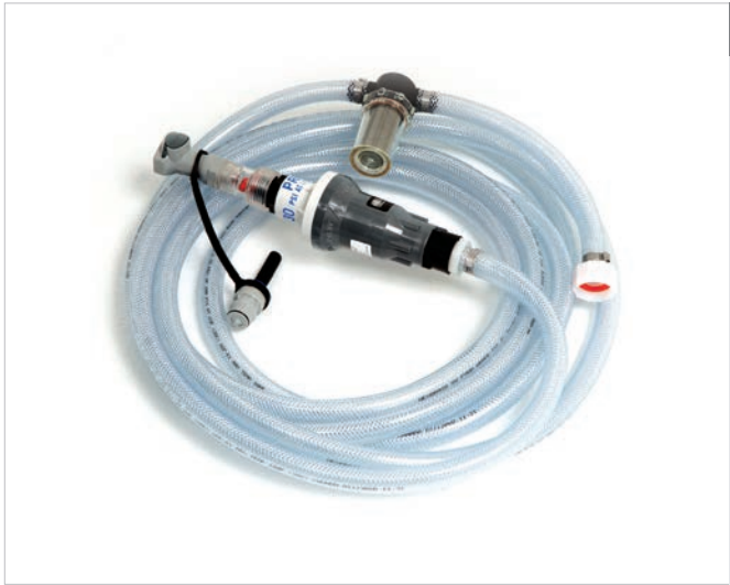
Pro-Fill® Regulated Water Supply Hose

2 REPLACEMENT PARTS - 600 REPLACEMENT CARTRIDGE JN6-DEION-RP-LC