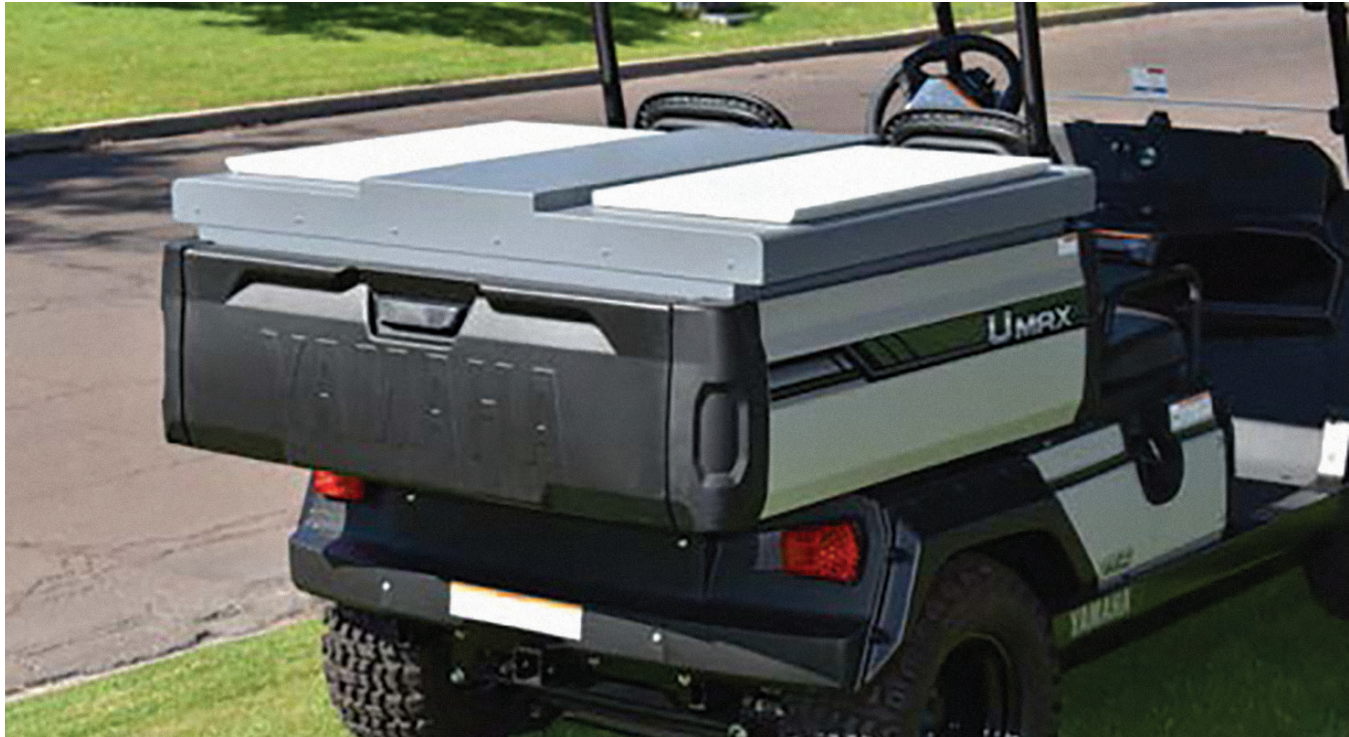
UMAX DropIn™ Cooler

Stay refreshed throughout the day with an innovative insulated beverage cooler. Rigorously tested to outperform other coolers, this addition conveniently holds eight 16oz bottles or twelve 12oz aluminum cans including extra space for ice. 544 cubic inch (2.35 gallon) capacity. Holds 9kg (19.8lb) total. GCA-JOB32-00-00