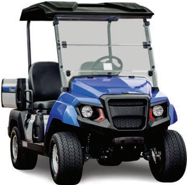
AQUA BLUE Metallic