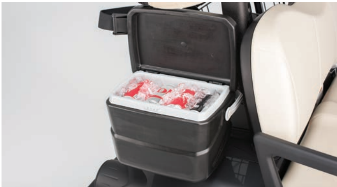
Yamaha Cooler Kit

Promote your course activities on this FusionFit™ Information Card Holder with incomparable strength that easily stands up to everyday use in any temperature. Fits 2010 and newer DRIVE and Drive² cars with factory ClimaGuard Sun Top. JOB-F16L0-V0-02 NOTE: Fits with ClimaGuard™ Sun Top.