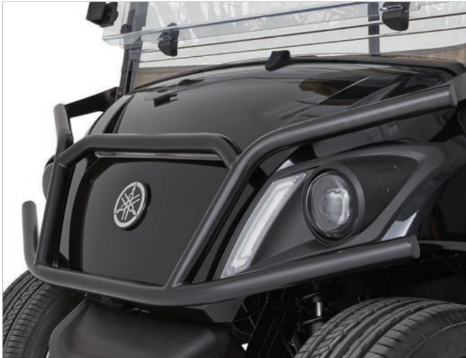
Drive² Front Brush Guard

NOTE: Use of 23" tall tires requires 20mm lift.