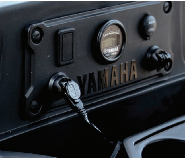
USB Charge Socket (Set)

These 1.5" clamps allow you to rigidly mount additional accessories or lighting, like the Bullet Accessory Lights (flood pattern (2HC-H4104-L0-00) and spot pattern (2HC-H4104-V0-00) are sold separately). Sold in pairs. Fits all 2019-2023 UMAX Rally models. Wiring modifications required. Electric models require 48V Voltage Regulator Accessory Kit, J0J-H1910-V0-00 (sold separately). 2HC-F34A0-V0-00