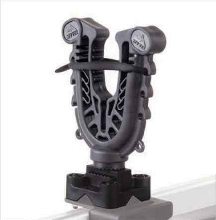
ATV TEK V-GRIP™

NOTE: Requires use of the separately sold ATV TEK V-GRIP™ or ATV TEK FLEXGRIP™ or ATV TEK Elite Series Cam Lock Grip. (Both are available in singles and doubles). Visit ShopYamaha.com to see all options and pricing.