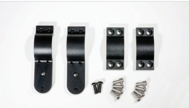
Accessory Mount Clamps

Never be without power again with this corrosion-resistant, water-resistant, marine-grade constructed 12V Accessory Plug and Receptacle Kit. Universal fit. Requires installation. Wiring modifications required. Electric models require 48V Voltage Regulator Accessory Kit, J0J-H1910-V0-00 (sold separately). 12V ACCESSORY PLUG ONLY 12V ACCESSORY RECEPTACLE ONLY DBY-ACC56-00-85 ATV-12VPC-00-RC NOTE: Can be installed from the front using the included mounting plate, or from the rear using the locking ring.