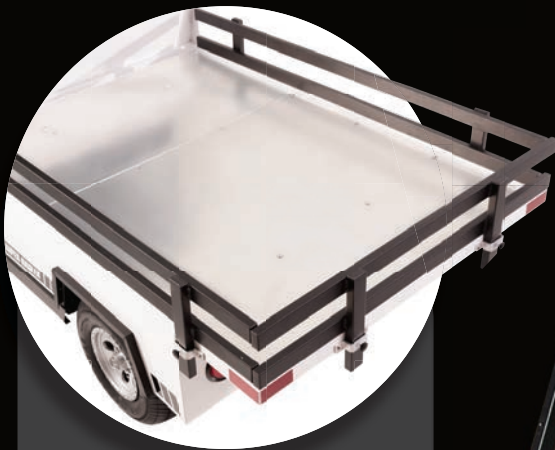
FEATURING 72" X 48" SUPERSIZED ALUMINUM CARGO BED.

Whether you're replacing water heaters or setting up for the day's big event, this extra-large hauler will handle your load. With durable, low-maintenance engineering and a super-sized aluminum cargo bed, it'll save you more than a few trips, not to mention headaches.