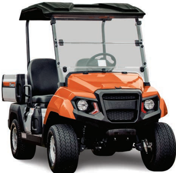
NOBLE ORANGE Metallic