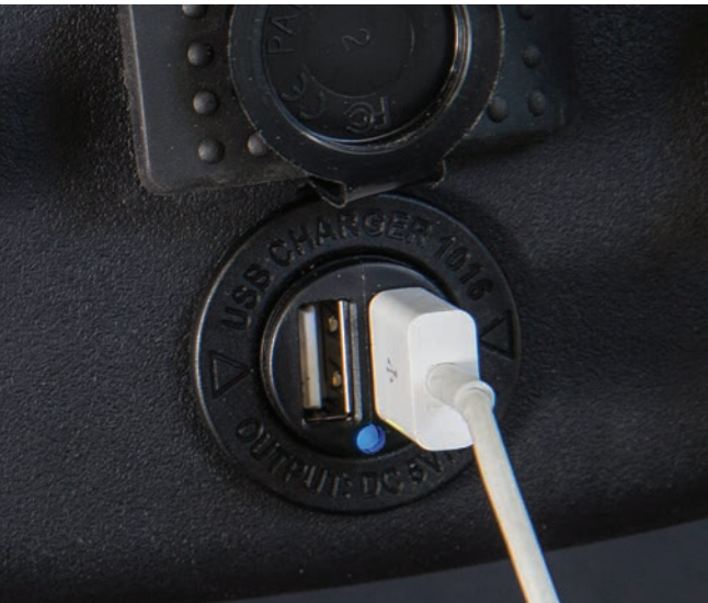
Waterproof USB Dual Charge Port

Allow occupants to conveniently charge devices on both sides of the vehicle, a win-win for drivers and passengers. Each USB socket can be easily installed in various locations. Fits all 2019-2023 UMAX Rally models. ELECTRIC CARS GCA-J0C70-00-00 GAS CARS GCA-J0A70-00-00 NOTE: Both electric and gas models include necessary fuse and voltage regulator. Uses factory mounts and plug-and-play harness.