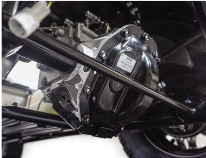
UMAX Rear Arm Skid Plate

Tackle rugged terrain with confidence after installing our Rear Arm Skid Plate to help guard against large rocks and other obstructive debris from harming your transaxle—all while perfecting your UMAX vehicle's tough styling. Fits all 2019-2023 UMAX Rally models.