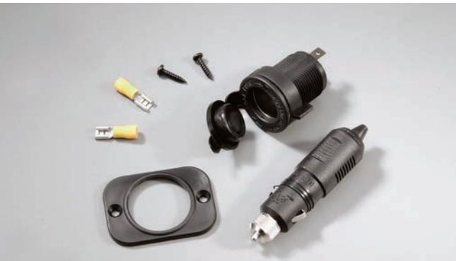
12V Accessory Plug and Receptacle Kit

With the UMAX DropIn™ Cooler, cold drinks are always conveniently stored and ready to go when and where you need them. Perfect for tournaments, company outings and more, this beverage storage solution provides instant profit gains. Cooler Lid Opening: 24.75" L x 15.4" W Internal Volume: 16,748in³ (72 gallons) Capacity: * 200 lbs total 1 UMAX One..... GCA-19HDR-OP-U1 2 UMAX Two..... GCA-19HDR-OP-U2 *Limited by unit's GVWR and payload capacity.