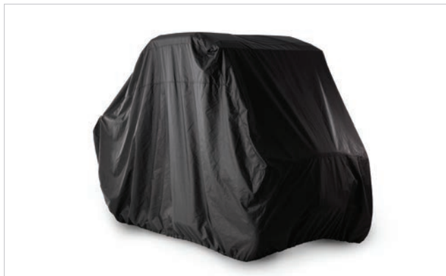
UMAX Storage Cover

NOTE: Requires a custom mounting solution and wiring to 12V source.