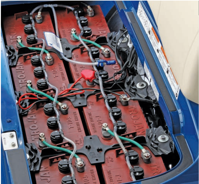
BFS™ Battery Watering System

Maximize the battery life of your Yamaha vehicle by using the BFS™ Battery Watering System that'll make routine maintenance a breeze. Low water levels in lead acid batteries are the primary cause of shortened battery life. Using a watering system saves time and money by filling the batteries simultaneously, providing a safer environment by reducing operators' exposure to battery acid. This accessory also improves battery life and overall performance. Fits 2019-2023 UMAX AC, 2017-2023 Drive² Concierge 4/6 AC, and Drive² Super Hauler AC models.