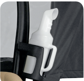
Divot Repair Sand Bottle