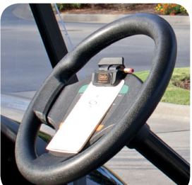
Comfort Grip Steering Wheel