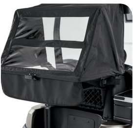
Bag Cover with Magnetic Latch