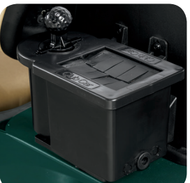
Ball and Club Cleaner