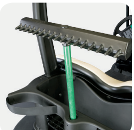
Sand Trap Rake Kit