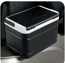
Caddy Master Cooler